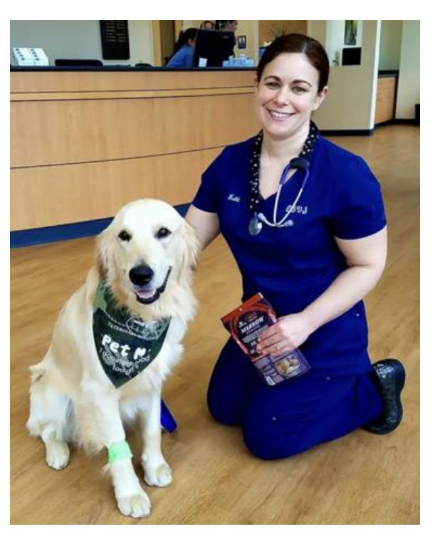
by becoming a blood donor!